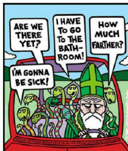
St. Patrick driving the snakes out of Ireland.

Fifth Sunday in Lent Ezekiel 37:1-4 Romans 8:6-11 John 11:1-45 Psalm 130