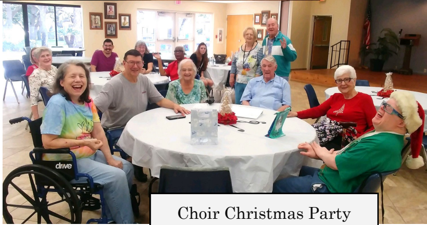
Choir Christmas Party