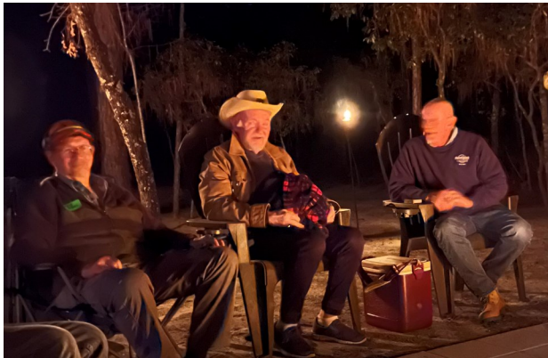
Men's' Group Bourbon & Cigar Evening