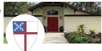
St Andrews Episcopal Church Spring Hill