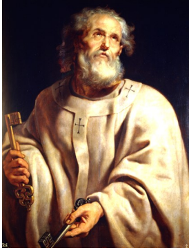
Saint Peter (c. 1610–1612) by Peter Paul Rubens

On June 29 we commemorate the martyrdom of St. Peter and St. Paul. Both of these men were executed under Nero sometime in the mid-sixties in Rome. Paul was beheaded and Peter was crucified. Legend has it that Peter asked to be crucified upside down because he said he was unworthy to be executed in the same way as his Lord Jesus was.