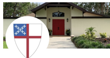
St Andrews Episcopal Church Spring Hill

“Like” and follow us and St. Andrew’s news will be right in your news feed.