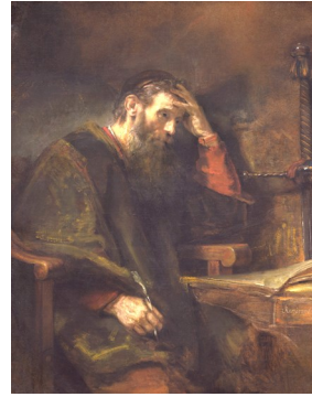
The Apostle Paul (c. 1657) by Rembrandt

On June 29 we commemorate the martyrdom of St. Peter and St. Paul. Both of these men were executed under Nero sometime in the mid-sixties in Rome. Paul was beheaded and Peter was crucified. Legend has it that Peter asked to be crucified upside down because he said he was unworthy to be executed in the same way as his Lord Jesus was.