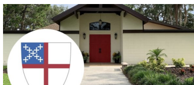
St Andrews Episcopal Church Spring Hill

This is a picture of our new Facebook page: