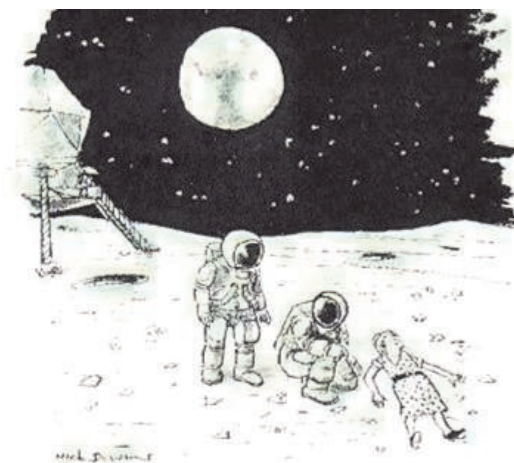
"It's Alice Kramden!"